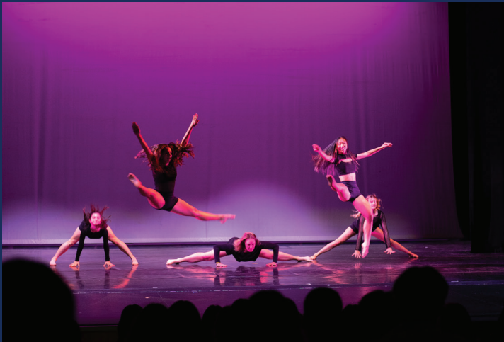
Pictured above, Hypnotiq (Hypno) is one of Andover's student-led and student-choreographed dance groups