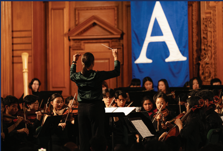
Andover's Symphony Orchestra features all of Andover's string players and select woodwind, brass, and percussion players.