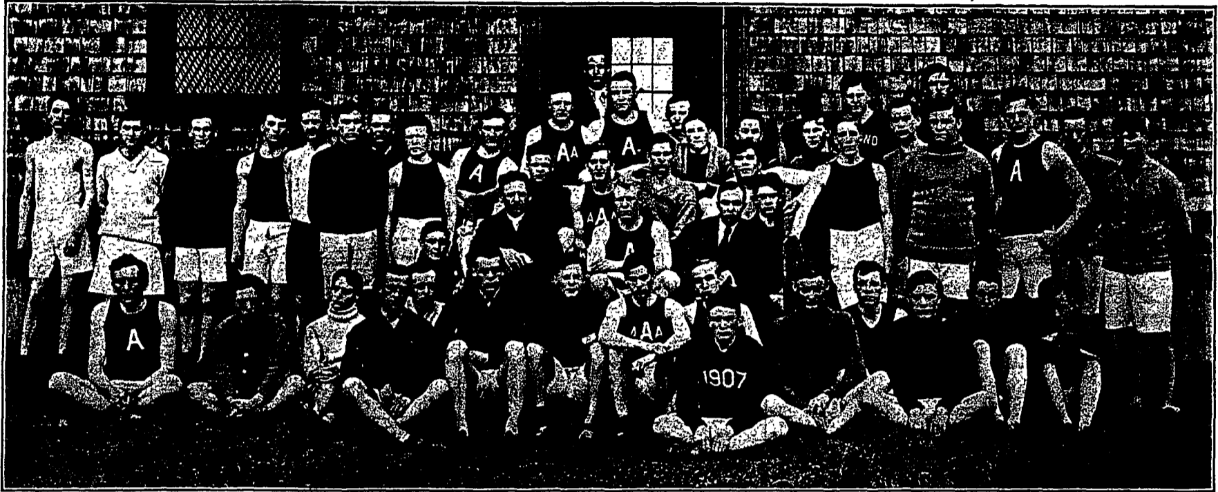
ANDOVER'S TRACK SQUAD