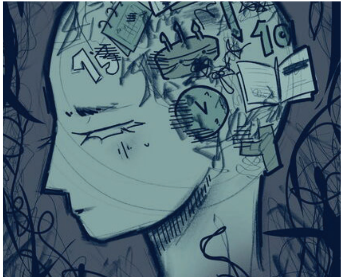
CARINA PAIK / THE PHILLIPIAN

The point of this is what you'll likely consider another lame reminder to take care of your health, and to sleep more, eat better, scroll less, but it is pretty serious. Something that would typically happen to a seventy-five-year-old is happening to people 60 years earlier. It's truly remarkable to think that