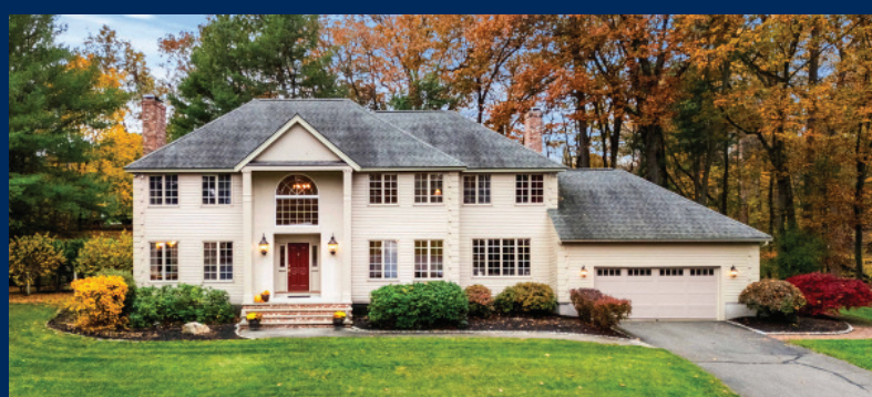
Andover | Renovated Colonial on a Cul-De-Sac 4 Beds | 2F 1H Baths | 1.7 Acres | Offered for $1,495,000