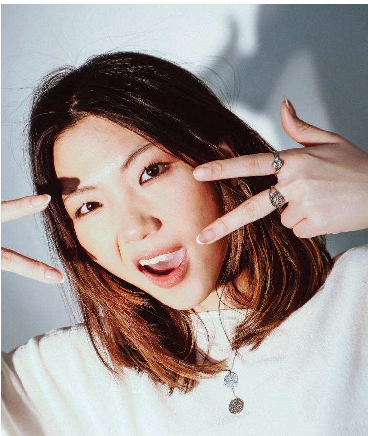
JEREMIAH NUÑEZ/THE PHILLIPIAN