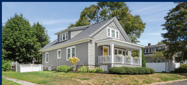
North Andover | The Library District 4 Beds | 2F Baths | Offered for $795,000