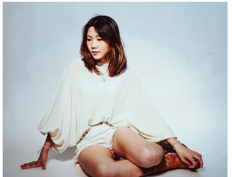
JEREMIAH NUÑEZ/THE PHILLIPIAN