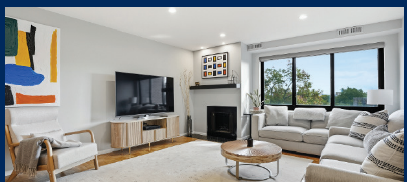
2130 Massachusetts Avenue, Cambridge Offered for $1,098,000 | Listed by Max Dublin