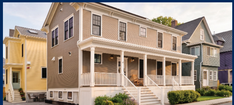
57 Museum Street, Cambridge Offered for $3,400,000 | Listed by Lauren Holleran Team