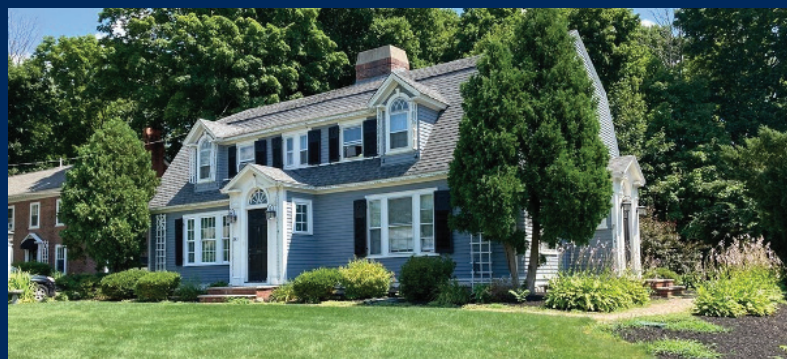
Andover | 3 Unit Multi-Family with up to 5 Income Streams Spacious 2,500 Sq. Ft. Main Unit | Offered for $1,895,000

Gibson Sotheby's International Realty Featured Listings