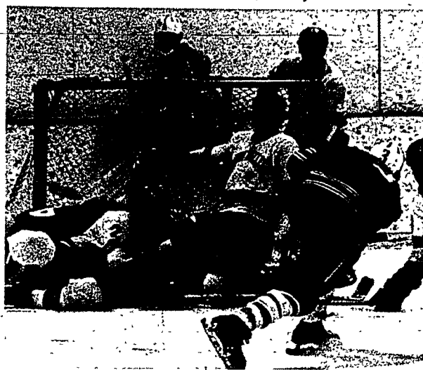
Mike Turner fires a shot at the cluttered BC net during the third period. The Blue tipped BC in overtime, 10-9, as Joe Cavanaugh scores winning tally.