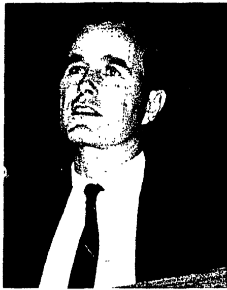
Cong. George Bush addresses assembly.

bombing. I don't necessarily say bomb more often, but I don't think we ought to stop the bombing. I'm convinced in my own mind that the bombing is helping us win this war militarily.