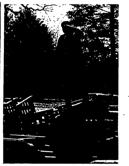
Noah Eisenberg, atop the rubble of the ark, watches the flood waters recede.

Alex Sanger masterminded the whole production. The dance showed a loss this time of only 136 dollars, which the entrepreneur said he would collect from the crashers.