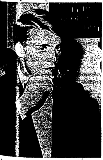
A respected member of the senior class smiles in celebration of the new rules.

Thurs., April 1 — The Student Congress voted last night to legalize drinking. The decision was unanimous.