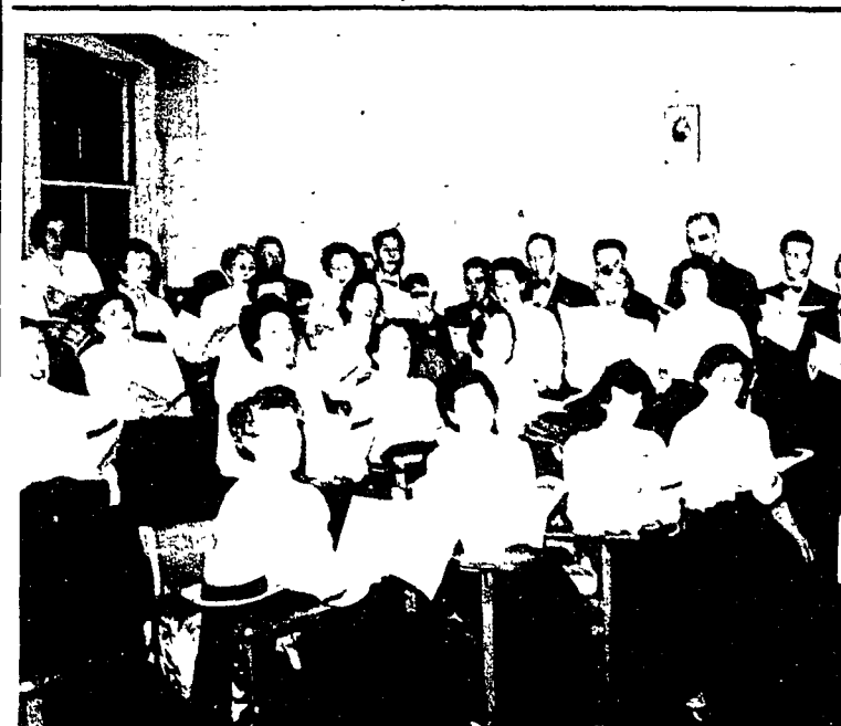
<sup>~</sup>Framingham Choral group practices before concert in the chapel.

project in which everyone - re-gardless of where he comes from or what his job is - has the com-mon desire to continue learning. 60% of the group come from towns