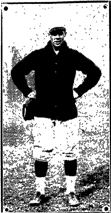
MEREWETHER Baseball Coach