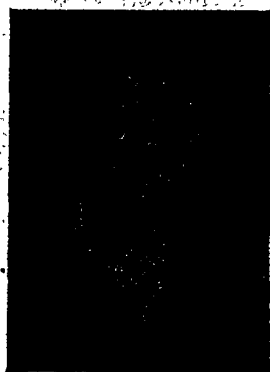
N. BURTON PARADISE Orator